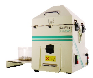
Portable / Manual Feed Pellets