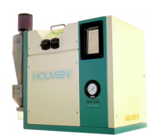
Desktop / Automatic Feed & Wood Pellets