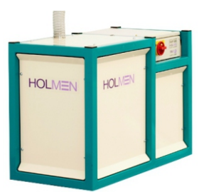
In-line / Automatic Feed & Wood Pellets