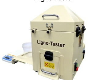
Portable / Manual Wood Pellets