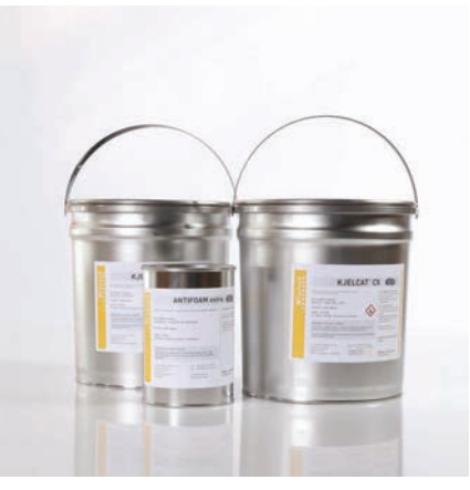
KJELCAT catalysts and anti-foaming tablets

"The variety of our accessories range is unsurpassed. We can satisfy any requirement."