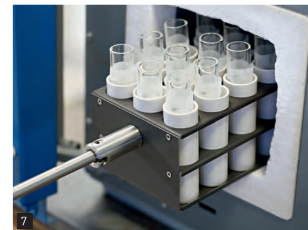
The incinerating module with a long handle makes handling of samples easier.