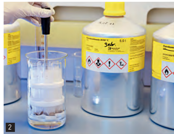
Convenient, time-saving degreasing with solvents in the degreasing module. 6 samples can be treated at the same time.