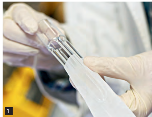
Easy handling: Insert FibreBag, weigh sample and you're ready. No need to seal the filter bag.