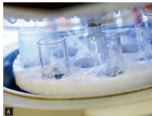
The rotating sample carousel ensures optimum bathing of the sample. The rotation is generated by the jet of detergent.