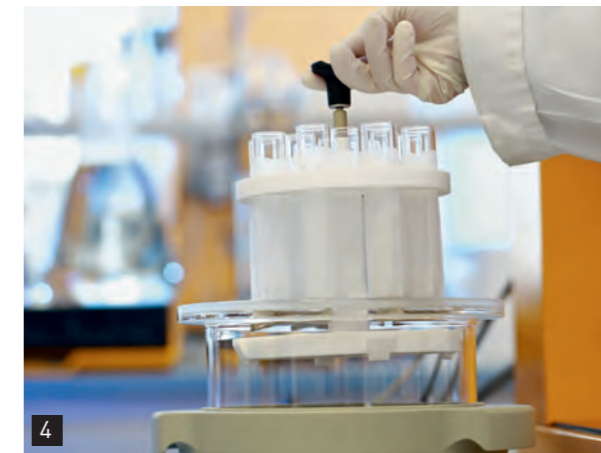
The removable handle makes it easier to insert and remove the sample carousel.