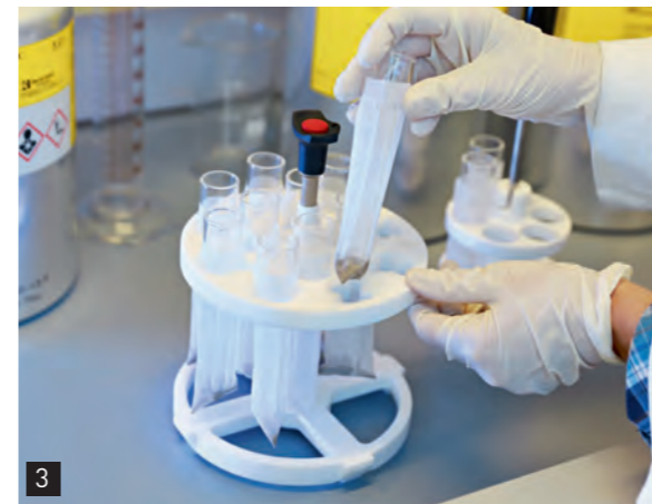
When the FibreBags are inserted into the sample carousel, they are automatically clamped firmly in place.